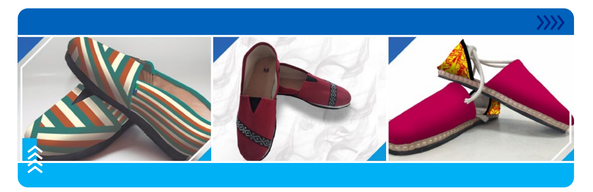
Talita Kum is a young textile company located in Las Breñas, province of Chaco, which specializes in the production of urban footwear, in particular the traditional and ancestral Pampa alpargatas or espadrilles, as well as workwear for health, construction and gastronomic industries, among others.

INTI's professionals assisted the company in processes to improve the production and product quality systems, which has allowed it to adapt to new market requirements and significantly improve its productivity and logistics. These improvements led to an important increase in the production of preventive clothing against COVID-19.