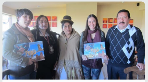
INTI PHOTO FILE

INTI's capacities to strengthen the textile industry in countries of the region have been made available within the framework of international technical cooperation projects. It is worth mentioning that in the last 10 years INTI has been executing projects to strengthen the capacities of state institutions in Peru and Bolivia, with financing from the FO AR (Argentine Fund for South-South and Triangular Cooperation) of the Argentine Foreign Ministry. All of them have achieved not only the transmission of knowledge for the implementation of ISO standards in laboratory